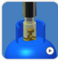
Valve-opener and tightening device